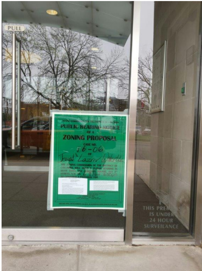
1. ZC 16-06 Posted 4-27-16 1900 Half Street SW