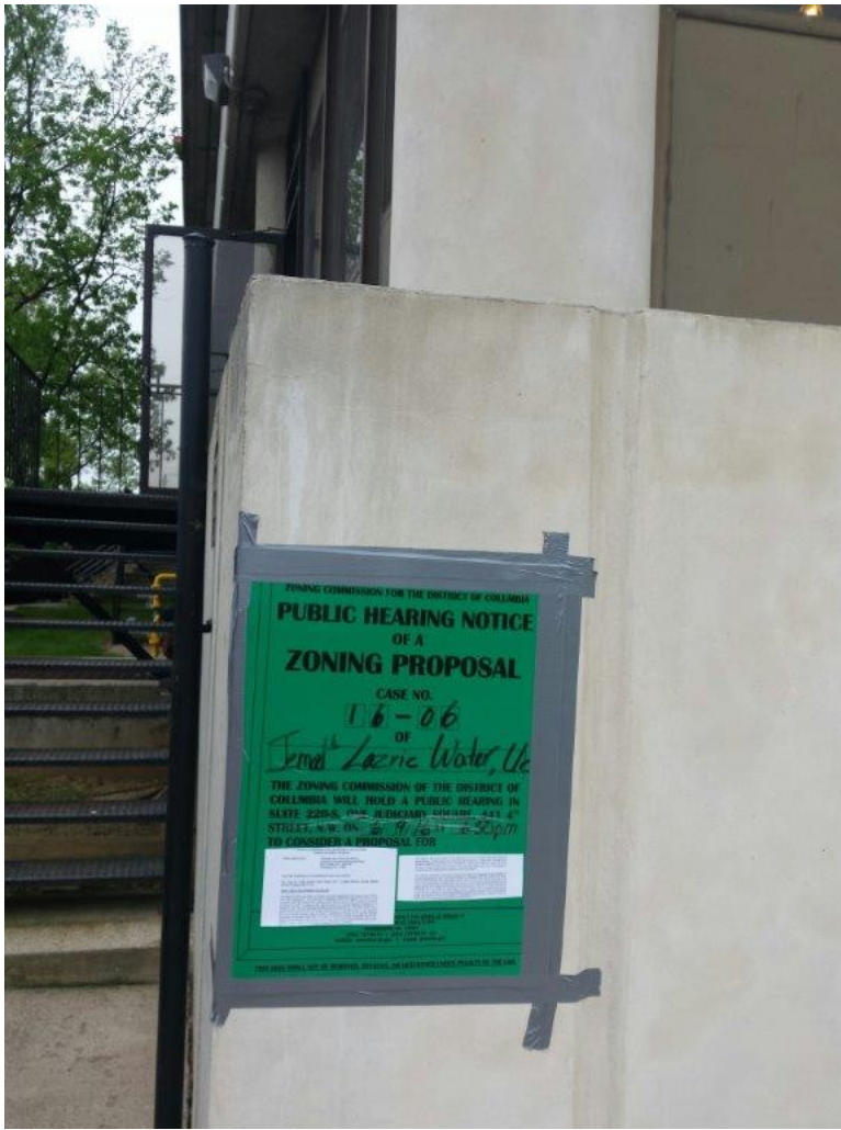
2. ZC 16-06 Posted 4-27-16 1900 Half Street SW