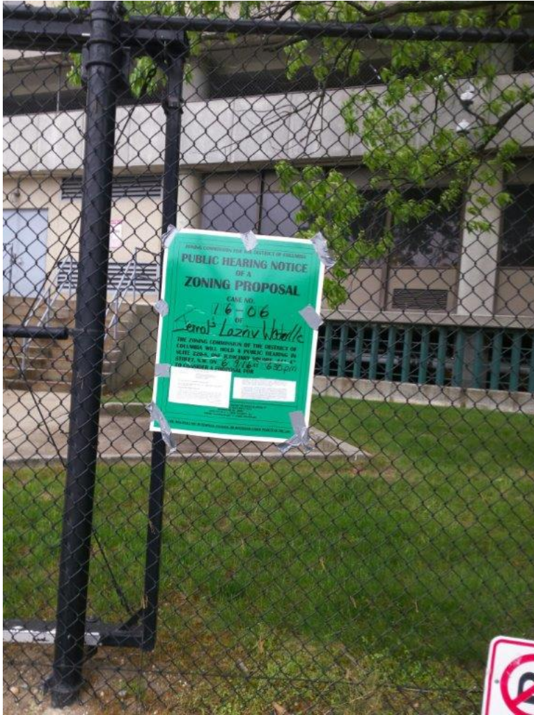
3. ZC 16-06 Posted 4-27-16 T Street SW